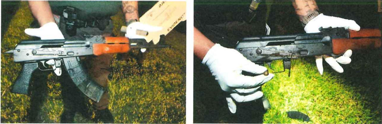
Photographs 2 & 3: Century Arms Rifle in the “fire position” and cartridge from the chamber

was in the “fire” position and contained one cartridge in the chamber and eight (8) cartridges within the thirty (30) cartridge magazine.